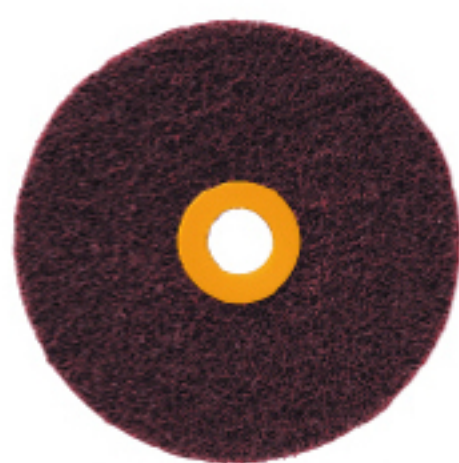
Working surface (Medium)