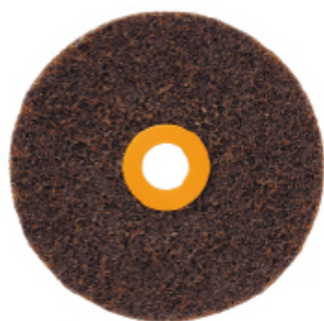
Working surface (Coarse)