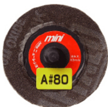
Working surface (Grain type A)