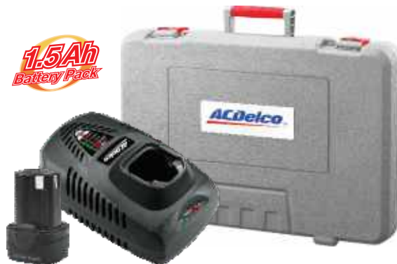
Includes: 2 Batteries, Charger and Carrying case