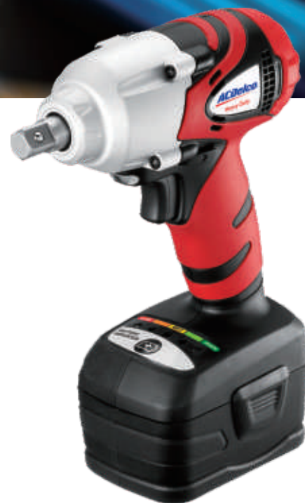
Model No. ARI2061B